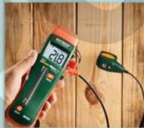
Pin Moisture Probe (MO-P1) included for making contact moisture measurements