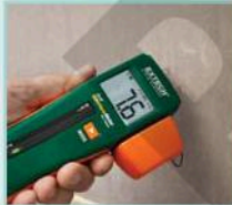
Measures % of Moisture in sheet rock and other building materials using direct pin method. Protective cap snaps onto the side of the housing during use.